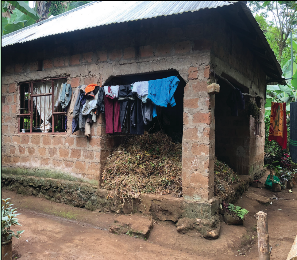
Nemes' family home, a 2 room house for 5 people without any indoor plumbing or glass in the windows.

Life had not always been this hard for the family. But when Nemes' father was diagnosed with a terminal illness and became unable to work, things got very tough.