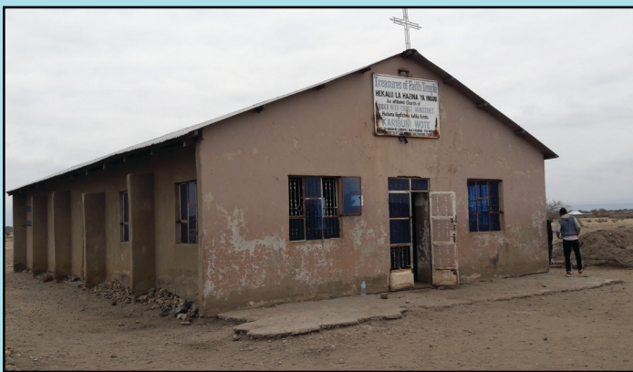
Above: Church in need of repairs and renovation

The climate in Tanzania brings many challenges. This is especially true during the spring and summer. During the dry season, strong winds bring dust from the mountain areas and the dust passes through the place where the church is located and negatively affects the building. The wind has often loosened the metal roof