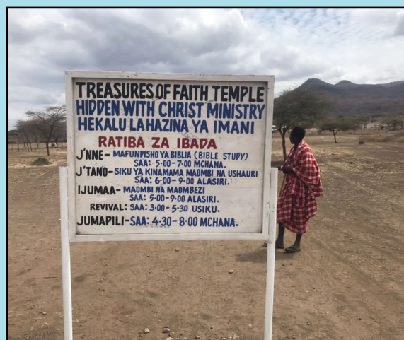
Above: Church gets a new signboard

This project took one month and two days to complete in its entirety. After all the renovations of the church were completed, the church's appearance was very pleasant. The Pastor and assistant Pastor, as well as other church leaders, church members and even the neighbors around the church were so happy. They sang Christian Maasai songs and jumped up and down for joy. Some of the neighbors came and