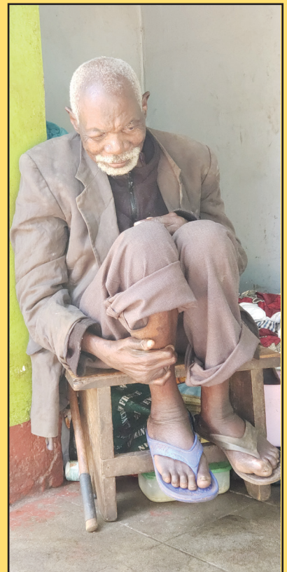
Above: A resident at the home for the elderly in Moshi Tanzania

It was our deep desire to help remedy this lack of indoor bathrooms and bring some dignity back to these precious senior citizens. Because of some very generous donations to our REHEMA PROJECTS – we were able to begin the construction of indoor bathrooms at this Home for the Elderly. It was a huge undertaking. We hired a well-respected contractor who had a heart for the project, and with his diligent effort, this project came to fruition.