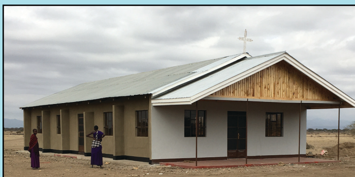
Above: Church after addition of front porch and wall repairs

I glorify God for the way that HWC Ministries has been touching lives in the Tanzanian community, through its ministry to churches, children, widows, and the helpless who are blessed by its work. May the God of heaven bless every good work done through this ministry and bless those who have supported HWC in Jesus' Name, Amen.