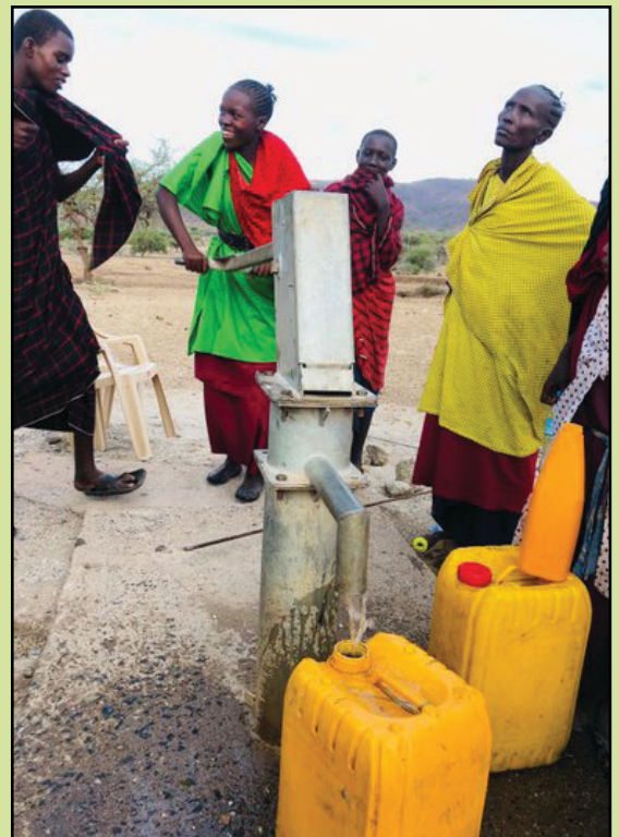
Water flowing from the repaired well!