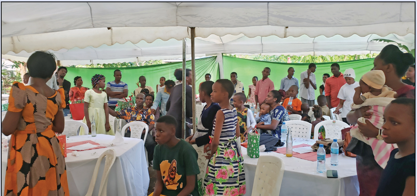
A joyful "family reunion"

Without a doubt, the highlight of the event was hearing from our three "guest speakers." Each one of them had grown up at Treasures of Africa Children's Home and all are now studying at the University or post University level. They gave such profound encouragement and advice to the younger students, that the Board of Trustees, who sat listening, were amazed. They could see the fruit of this important work in the lives of those who are now young adults, preparing for leadership in Tanzania.