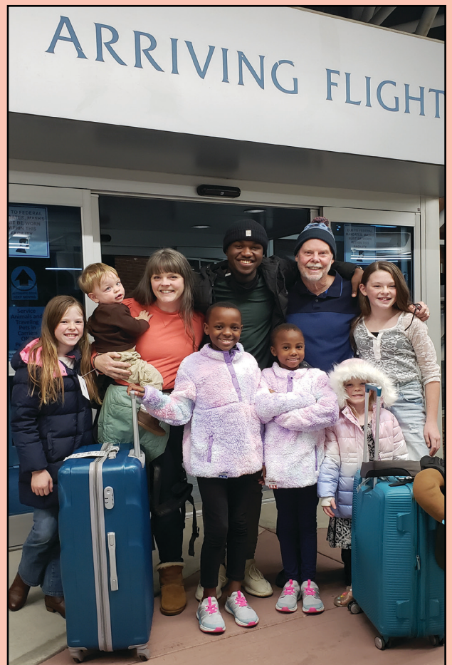
Arrival in the USA